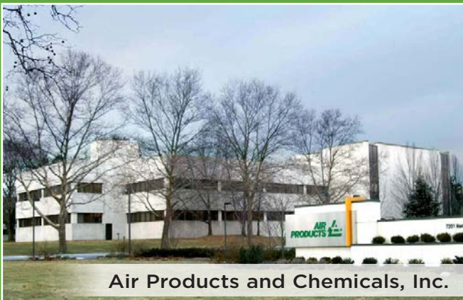
Air Products and Chemicals, Inc.

“ Air Products and Chemicals, Inc. is very pleased with the total effort put forth on our Administration III flood recovery. Your initial response and subsequent process used to stabilize and ultimately repair the destroyed areas has many of the employees of the facility pleased and somewhat amazed. My personal thanks to all members of your team and the subcontractors you used. ”