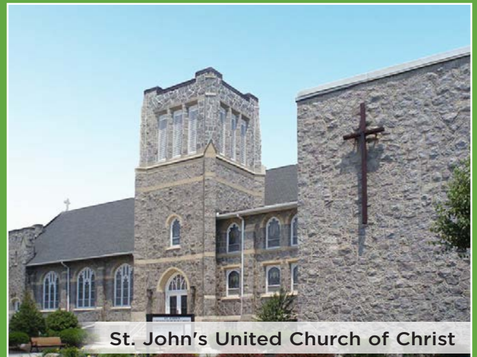
St. John's United Church of Christ